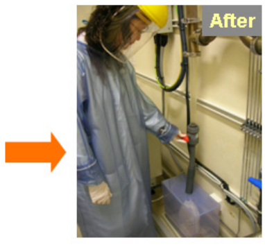
Ergo-friendly Maintenance control