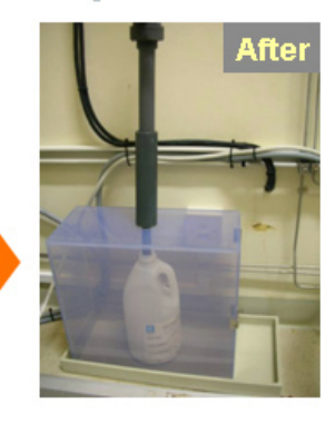
Cabinet provides round the clock protection to contain potential leak