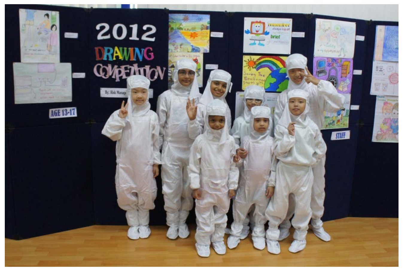
Children had fun experience wearing cleanroom gown