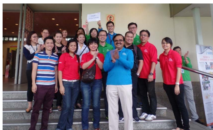
Team 1 volunteers celebrating their victory with Jag as being the team that picked the most litters.