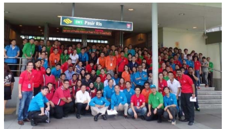
Group photo for all participants: SSMC, NXP, NEA, PHC, SMRT, Siglap Secondary School.