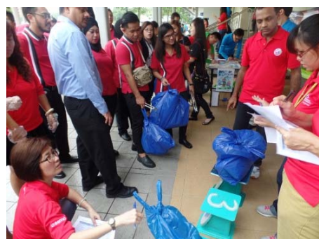
Weighing the litters to determine which team collected the most litters.