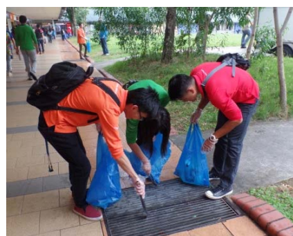
SSMC volunteers busy picking up litters.