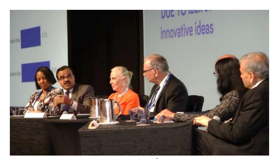
SSMC CEO joins Team A in the TECHXCHANGE